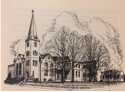
First Presbyterian Church on Marietta Street circa 1931