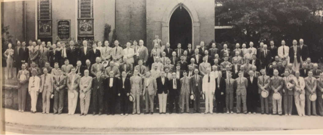
Men of the Church, First Presbyterian Church Marietta Street, circa 1922

Dr. Henderlite also recalled that he had preached 2,500 sermons, baptized 780 infants, performed 257 marriages, conducted 383 funerals, and made between 25,000 – 30,000 home or hospital visits.