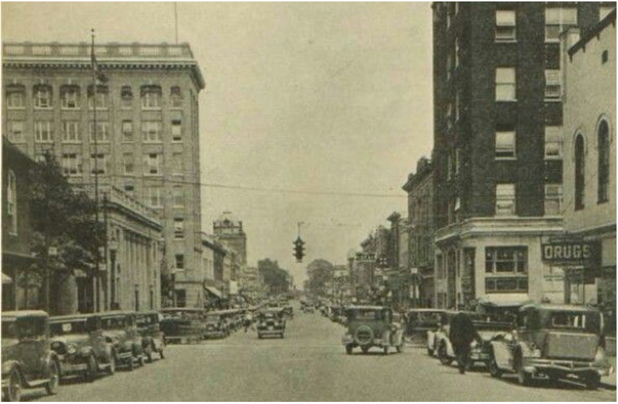
Main Avenue, Gastonia, N.C. circa 1920